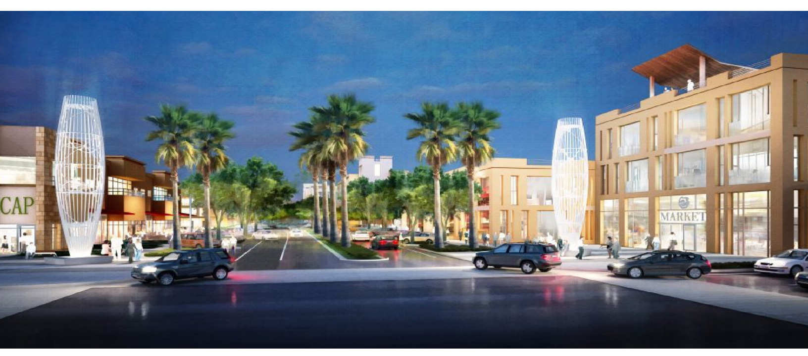
View of Capitol Ave. from Fremont Blvd.

With its ideal Silicon Valley location, Downtown Fremont is poised to become a vibrant and sustainable urban mixed use district that will serve as a destination for the city and region. Incentives are in place for new development that will help create an exciting, new "strategically urban" district in Fremont.